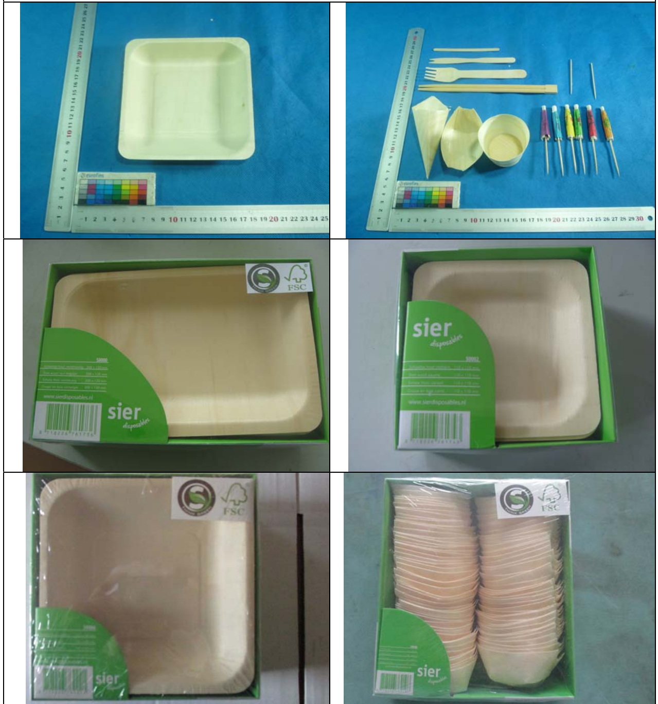
Photo Attachment WOODEN DISPOSABLE ITEMS